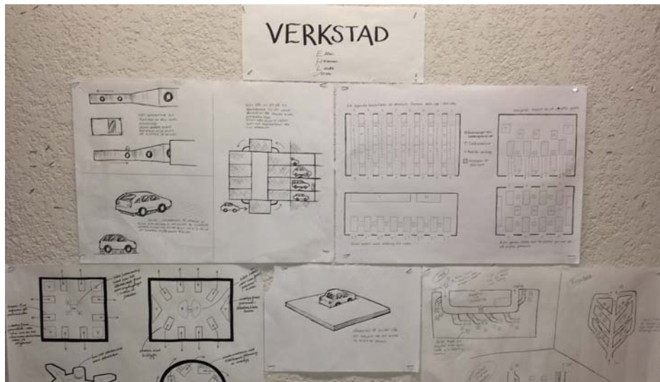
Figure 1. Sketches from Phase 1 ("Verkstad" = Workshop)

The ideas could be on any level, overall schematics as well as detailed design of specific solutions. The aim was to build a wide range of ideas that the whole class could use as inspiration and input for ideas in the later stages of the project, so the focus was more on quantity than quality, and novelty was endorsed. After this phase, the sketches were posted on a wall and the groups were asked to analyse and explain each other's sketches to see if they were understandable and self-explanatory. These sketches then became everyone's property because the course changed from group work to individual work and each student was supposed to design a full layout of the tyre shop.