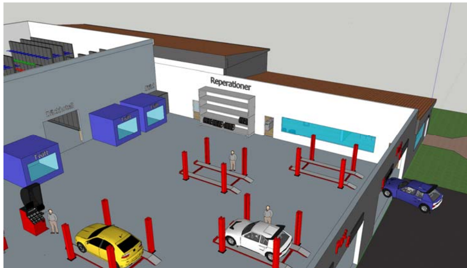
Figure 3. Screen shot from 3D animation of workplace design concept.

teaching staff. The students could use previous sketches and layouts but were obliged to create a 3D animation using Google SketchUp. Figure 3 shows a screen shot from one of the animations.