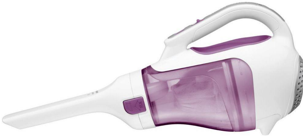
Figure 1. Black & Decker CHV1210 Dustbuster 12-Volt Cordless Cyclonic Hand Vacuum Cleaner