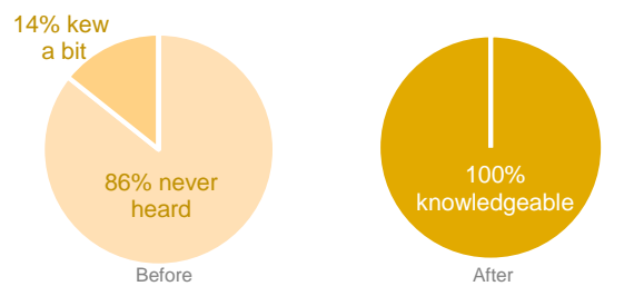
Figure 7. Student feedback on how knowledgeable they were before and after the project about the potential of mycelium as a biomaterial

Material Futures aimed to increase ecoliteracy, with a focus on improving psychological distance and avoid technological insulation. To improve psychological distance the project allowed hands on experimentation with mycelium through a workshop and subsequent growing process. Before the project 86% of the students never heard about the potential of mycelium as a biomaterial as compared to 100% knowledgeable after the project (Figure 7). Moreover, 60% of the students considered the workshop extremely useful to their learning experience and their feedback was encouraging: 'The Osmose presentation for the project was really helpful in understanding the makeup of the Mycelium. Overall, the project was fantastic' (9) and 'The workshop was good and provided all essential info, the only thing I would add is a deeper look into other ways of manufacturing mycelium' (9). Regarding the use of biomaterials in other future projects, 60% of students stated they were likely and 40% very likely, due to the positive environmental impact.