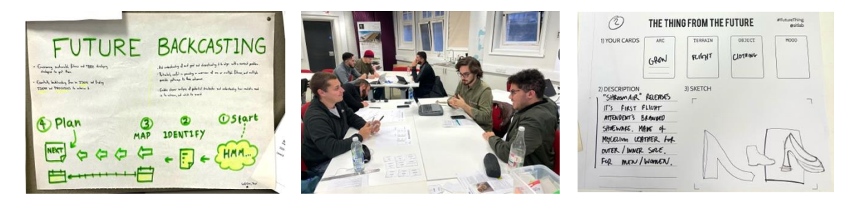
Figures 4. to 6. Stage 2 concept development included Future Cones, Future Back Casting and The Thing of The Future methods

Within stage 2: concept development, methods such as: cones of future, future back casting, and the thing from the future, were used to spark debate and question how some sustainability principles such as recycle can lead to negative environmental impact. The first method used was futures cone, through outlining preferable and probable future scenarios, once that was defined, students started working backwards to identify strategies that connect future to present, in this specific case how to create a culture of co-evolution between humans and mycelium (future back casting method). Within this method students were encouraged to explore concepts of convenience, single use within bio fabrication (e.g.: if we use biomaterials do we need to worry about single use?) and negative environmental impact offset strategies. In addition, students drafted a system map that considered the local social and health context of their proposal and unintended consequences to natural systems. Besides future back casting, The Thing from the Future game, created by Situation Lab, was introduced to students. Players were challenged to work collaboratively, in small clusters, to describe objects from a range of alternative mycelium-based futures and generate design proposals to randomly allocated scenarios. This stage was highly enjoyed by 85% of the students as per project feedback (Figure 4 to 6).